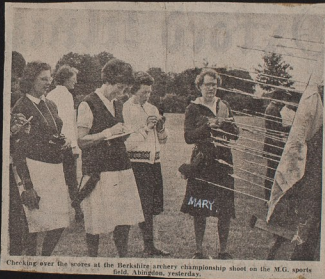
Checking over the notes at the Berkshire archery championship shot on the M.O. sports field. Abingdon, yesterday.